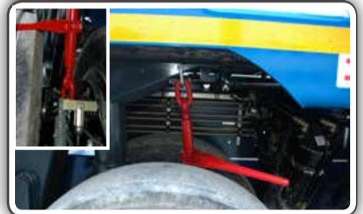
8 Place chain spanner