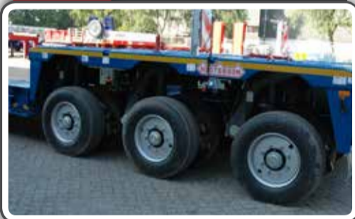
9 Raise axle bogie