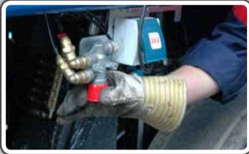
1 Activate parking brake