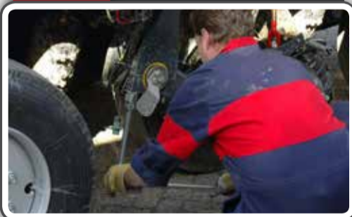
13 Remove front axle knee nuts