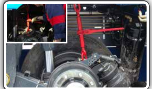
12 Lower wheel onto the ground with chain spanner