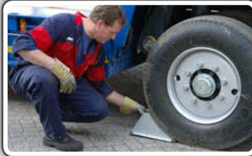
2 Place wheel wedges