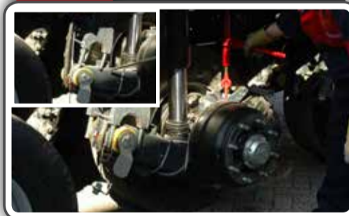
15 Free knee joint under axle knee