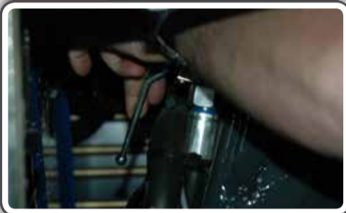
5 Shut valve on axle