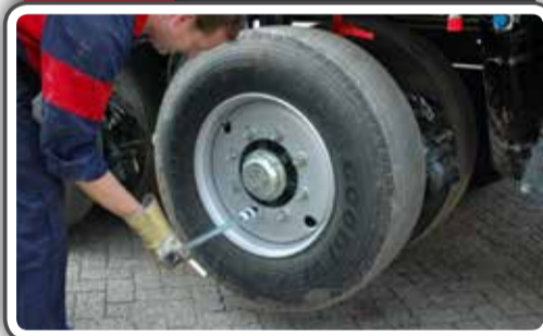
10 Remove outside wheel