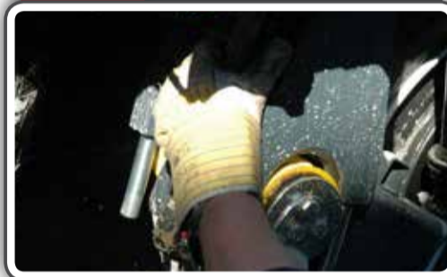
7 Free hose bundle