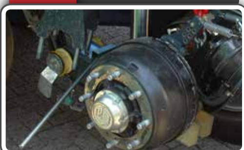
17 Turn inside wheel outwards