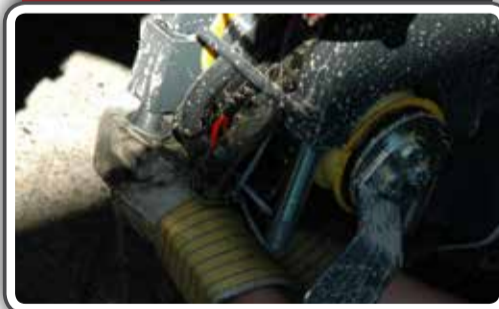
14 Remove knee saddles