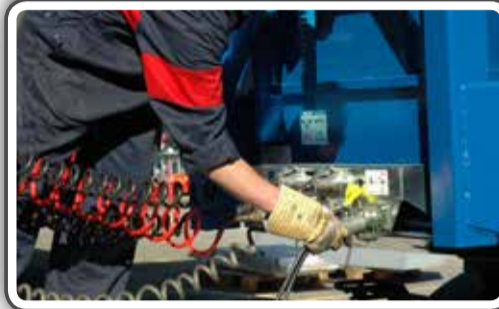
3 Connect white cable