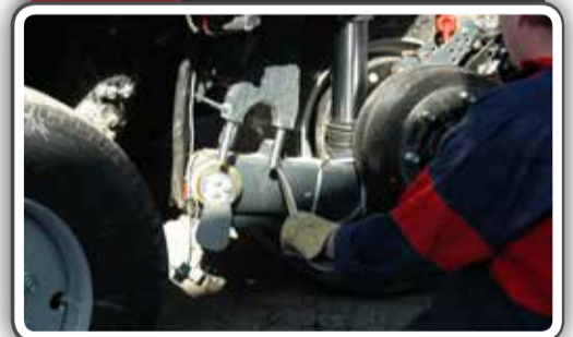
16 Turn axle with crowbar