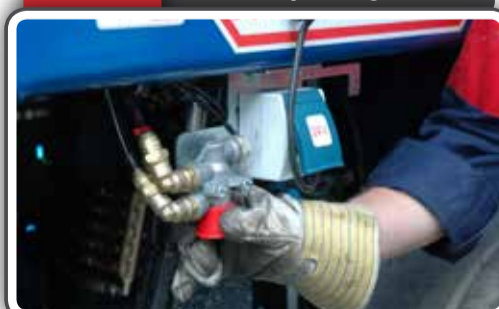
19 Release parking brake