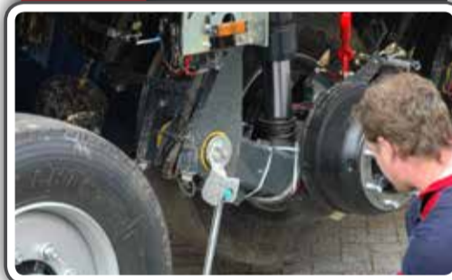
11 Remove rearmost axle knee nuts