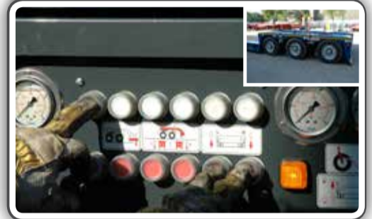
4 Lower axle bogie