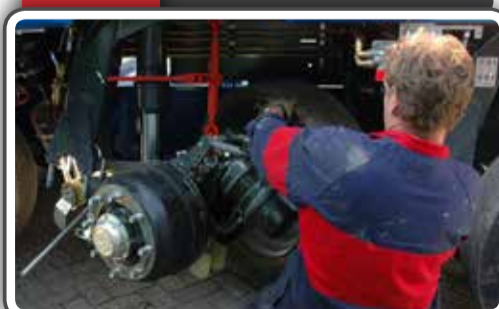
18 Remove inside wheel