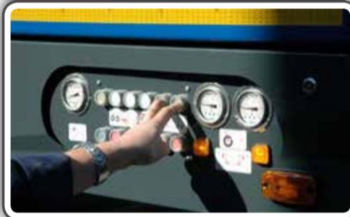
6 Raise axle bogie up to ride height